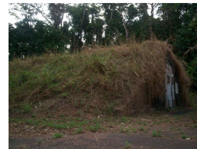
Bunkers at Group 6