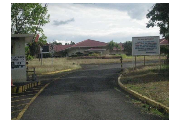
George Dewey Wellness Clinic