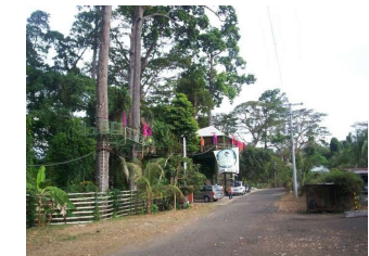
Tree Top Adventure (Jest Camp)