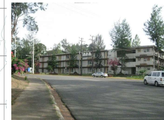
Cubi Heights Mixed use Development (Crown Peak, Holiday Inn, Legenda Suites)